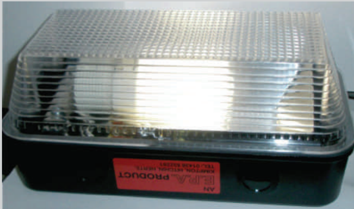
EPA Products IP65 24VDC & 12VDC Bulkhead Lamp Installation